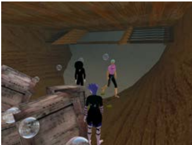
Figure 2. Snapshot from 7 Mar 2008.

In future work I intend to adopt a systematic approach to the analysis of my data. A possible beginning