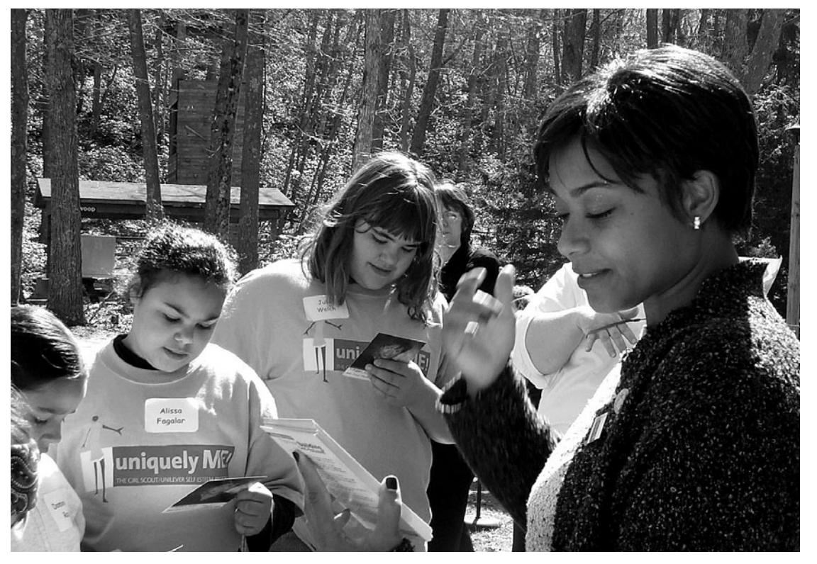
Girl Scouts read about self-esteem with Olympic gold medalist Dominique Dawes, the national spokeswoman for uniquely Me! The Girl Scout/Unilever Self-Esteem Program. The program is a response to an alleged nationwide problem of low self-esteem among girls in underprivileged communities. Recent evidence suggests there is no such problem.

And although women have slightly lower self-esteem than men, the difference seems to be mostly due to women's dissatisfaction with their bodies: Men think their bodies are OK, but women think they are fat or otherwise unattractive. Women do not think they are less socially skilled than men, however, or less intelligent, less moral, or less able to succeed. Overall, the differences between men's and women's self-esteem are so small that many do not consider them to be meaningful.<sup>5</sup>