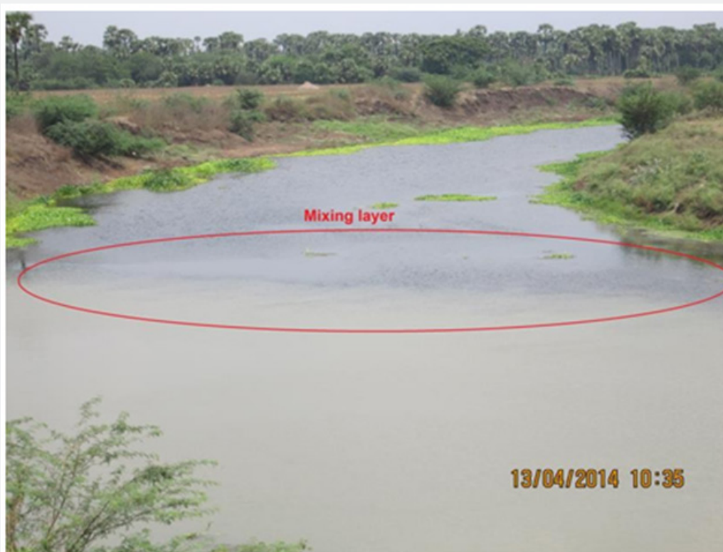
Figure 2: Mixing layer along the confluence.

was also observed due to partial diversion of flow from main channel to the lateral channel in case of low discharge ratios [21]. The depth ratio is more in subcritical flow than transitional flow because of low velocity and high flow depth associated with subcritical flow [22]. As the discharge ratio increases, the momentum of lateral flow increases and pushes the main flow towards outer bank and acts as an obstruction to the incoming flow in the main channel. This causes rise in flow depth at outer bank in the downstream channel.