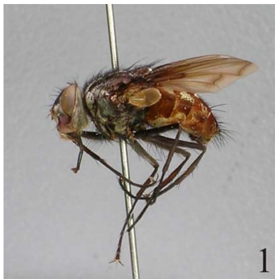
FIGURE 1. Prophorostoma pulchra Townsend, male, lateral view.

Head: Frontal vitta at mid level about twice as wide as fronto-orbital plate, but subequal at level of lunule. Interocular space strongly constricted above, a little before the ocellar triangle. Frontal setae slightly proclinate.