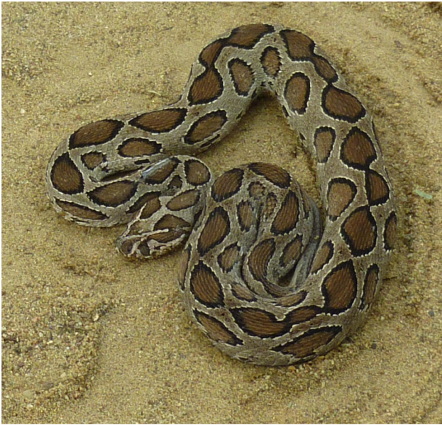
Figure 1. Russell's viper ( Daboia russelii ) adult specimen from Sri Lanka. Russell's vipers are distributed throughout Sri Lanka except at higher elevations (>1500 m) and are abundant in agricultural lands in the rural areas of the island's dry zone. doi:10.1371/journal.pone.0090198.g001

chronic renal failure [11], myocardial infarction [12] and secondary hypopituitarism [13] have also been reported in Russell's viper bite patients in Sri Lanka. Although generally not severe, local swelling has been a common feature seen in this country [8,10].