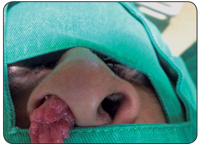
FIGURE 3. Vascular/polypoid mass hanging from the right nostril of a patient with rhinosporidiosis.

In all our patients, the site of infection was the nose. No concomitant infection was observed at other sites (the eye,