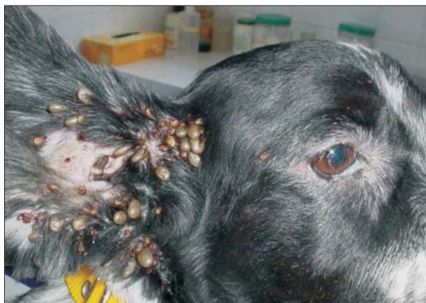
Figure 3 - A female adult dog highly parasitized by R. sanguineus .

Tick-borne diseases are recognized as an emerging public health problem in many countries 30 and R. sanguineus has been linked to some of these diseases, such as boutonniuse fever. It