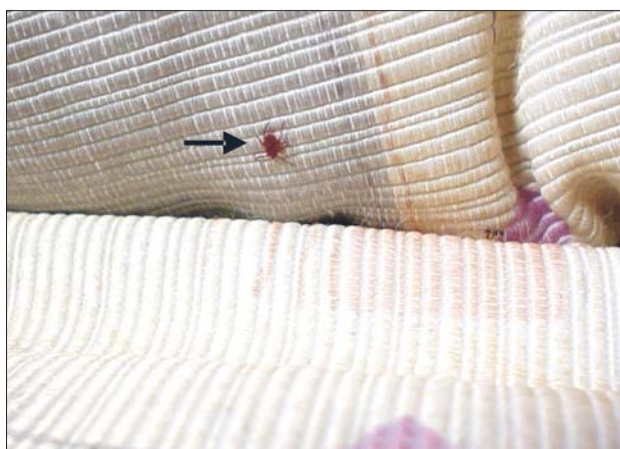
Figure 2 - A male Rhipicephalus sanguineus (arrow) found on the sofa of the residence of the case from Recife.

During the present investigation, as expected for a nidicolous tick 23 , several ticks were seen in the house, mainly on the sofa (Figure 2) and on the walls.