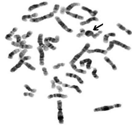
Figure 1. Metaphase of the case