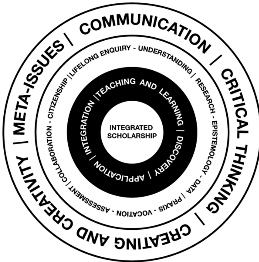
Figure 3. An integrated scholarship based on Boyer's scholarship reconsidered.

This philosophy rings true with work of Boyer and our speculative conceptualisations of the university of tomorrow. The famous Bauhaus pedagogy was depicted by founder of the School, Walter Gropius in 1922 in a circular diagram representing the interdisciplinary curriculum. DiSalvo (2019) explores new invigorated diagrams inspired by the original. These new versions include artificial intelligence, robotics, algorithms, data, sensors but also information and communication, culture, politics and ethics. Figure 3 takes inspiration from these works, along with Boyer to create a diagram for integrated scholarship for the university of tomorrow.