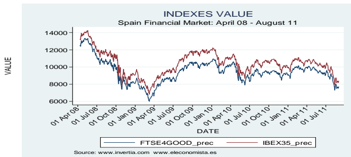
Figure 1: Daily evolution of IBEX35 and FTSE4Good IBEX

Figures 1 and 2. The line characteristic traced by the FTSE4Good IBEX, using the IBEX 35 as a reference stock index, shows a quasi-perfect positive correlation between the pairs of returns for both indexes, which indicates that both the sign and size of the behavioral patterns are similar (see Figure 2).