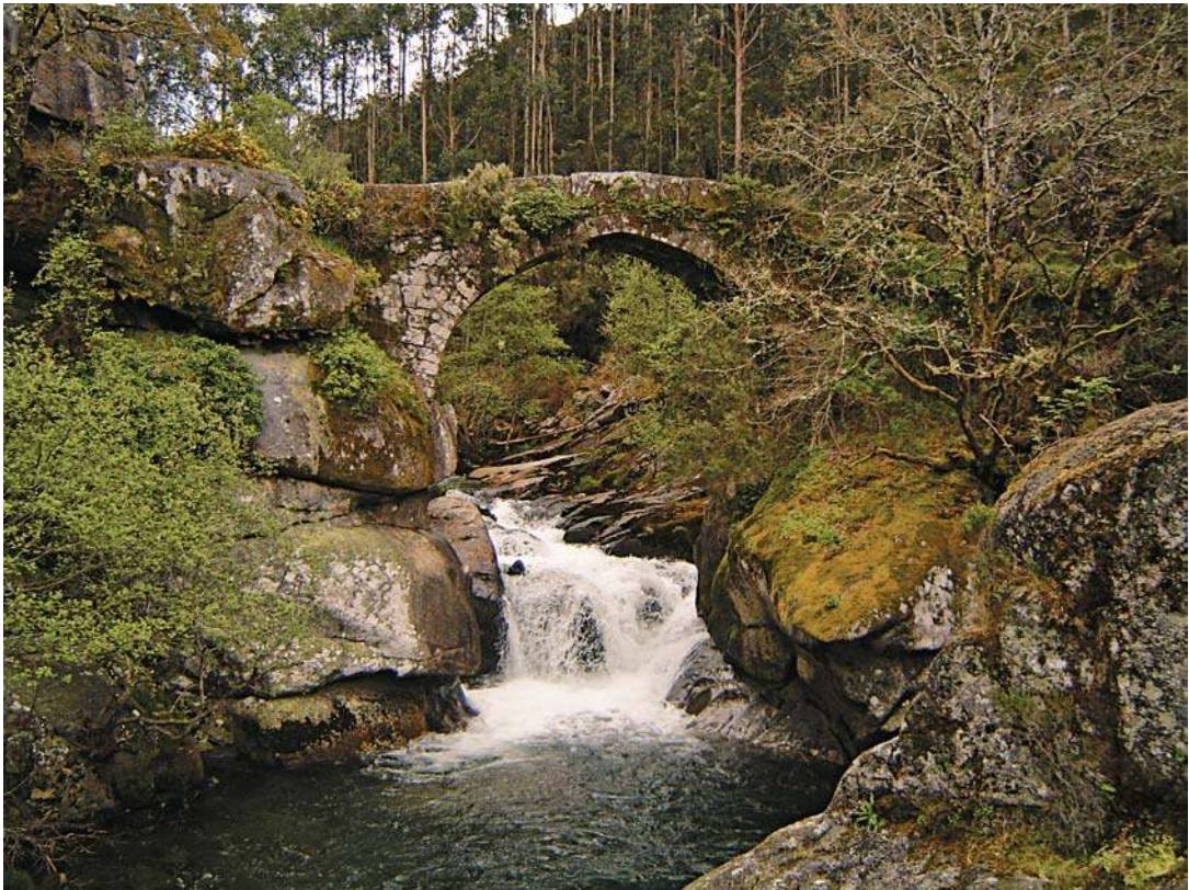
Carballedo, Cotobade, Spain

Copyright © 2011 Massachusetts Medical Society.