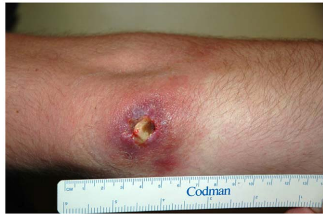
Figure 1. Photo of Buruli ulcer lesion. Right elbow, 32 year old male with PCR and culture confirmed Buruli ulcer. The patient spent just 4 hours at Barwon Heads on 11 May 2008 and had no known contact with any other endemic areas. He first observed the ulcer in mid-October 2008.

Adult mosquitoes were collected from December 2004 to December 2009, inclusive, using dry-ice baited miniature light traps as described previously [6]. These traps work by attracting female mosquitoes questing for a blood meal. The same trapping technique was used to collect mosquitoes in all locations, however the number of trapping nights varied in different areas. Between December 2004 and February 2006, mosquitoes were trapped monthly or every two months in Point Lonsdale by the Victorian Department of Primary Industries. From August 2006 to December 2009, mosquitoes were collected from multiple locations on the Bellarine Peninsula by the City of Greater Geelong. Traps were set fortnightly in Barwon Heads, Breamlea, Geelong, Ocean Grove, Point Lonsdale and St Leonards during