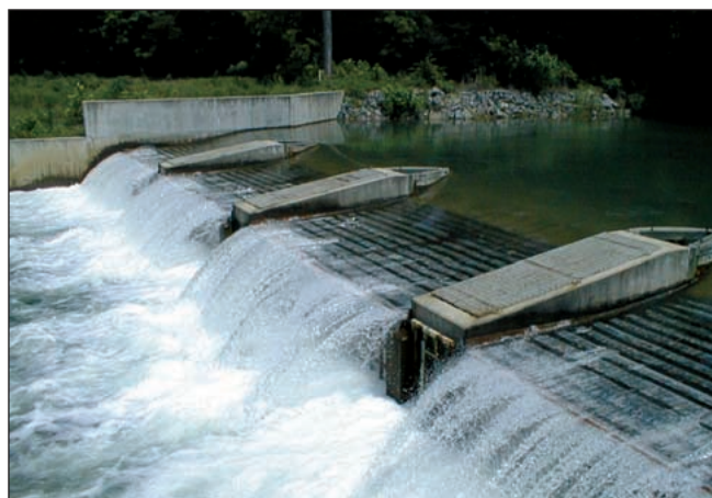
Figure 2. Improvements in Tennessee Valley Authority dam operations include (left) surface water pumps in the Douglas Reservoir (French Broad River, NC), designed to push oxygenated water from the surface to deepwater turbines, and (right) infuser weirs downstream of Chatuge Dam (Hiawassee River, NC), designed to provide both minimum flow and dissolved oxygen.