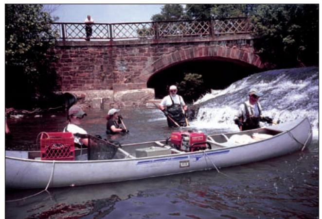
Figure 5. The effectiveness of dam removal as a method of river restoration is being evaluated in several regions of the US. (left) Scientists from Philadelphia's Patrick Center for Environmental Research study the removal of the 2-m high milldam on Manatawny Creek in southeast Pennsylvania in Aug 2002, (right) after documenting ecological conditions before the dam was removed (Bushaw-Newton et al. 2002).