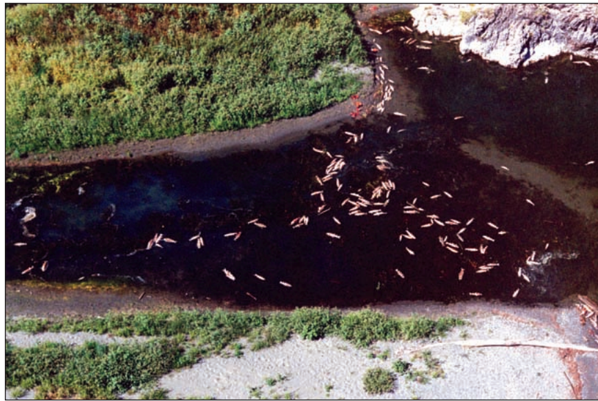
Figure 1. Dead salmon in the Klamath River, September 2002.

Already, scientists in North America, South Africa, Australia, New Zealand, and Europe are actively advising the public and river managers on the necessary quantity and timing of river flow needed to maintain desired ecological characteristics. Such advice is being provided in diverse political contexts, ranging from the cooperative to the controversial. In the US, scientists have helped guide efforts to recover endangered species in rivers like the Klamath, the Colorado, and the Missouri (NRC 2002b), to restore degraded flagship ecosystems such as the Florida Everglades (Holling et al. 1994), and to define the flows needed to protect ecological integrity on federally-owned lands (NPS 1996). In addition, scientists are now being