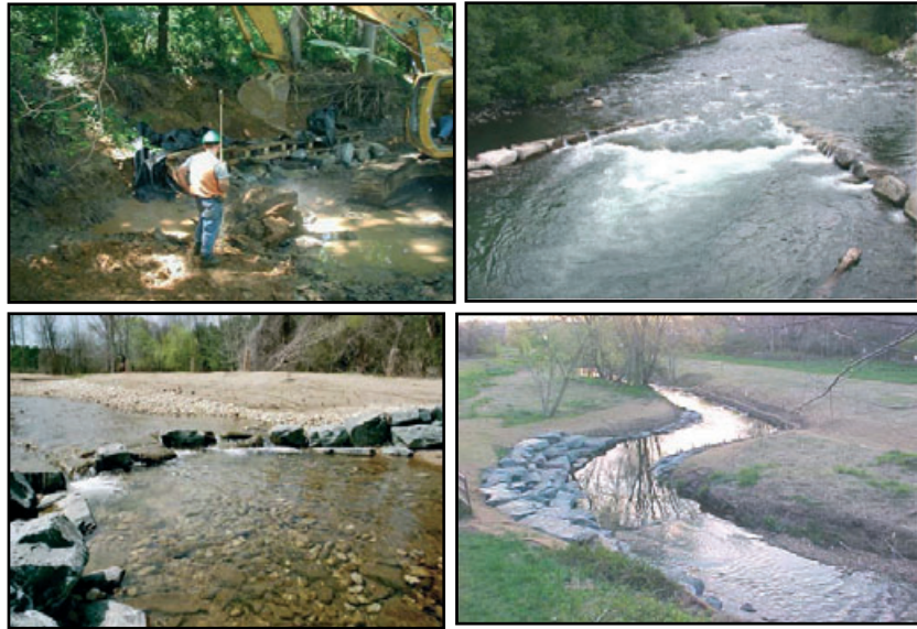
Fig. 2 Photographs of restoration projects in progress or completed to enhance habitat heterogeneity. Upper left: large equipment is typically used to re-configure and create artificial pools and habitat structures such as the wooden framework that will be used to create under-bank openings for biota. Upper right: rock weirs placed in the channel to deflect flows and add variable flow habitats. Lower right: artificial meanders created by re-configuring the channel. Lower left: in-stream rock structures to create shallow pools downstream.

uniformly blame the lack of response to a lack of real increases in HH because many of the studies quantified an increase in heterogeneity. Lepori et al. (2005) reported an eightfold increase in heterogeneity in the restored versus unrestored reaches, and the projects evaluated by Harrison et al. (2004) had significantly higher heterogeneity (quantified with coefficient of variation) in flow and depth (Pretty et al. , 2003). However, at least one study reported that increases in HH did not necessarily persist a long time even though restoration designs suggested they should; many variables describing habitat complexity and stability did not differ between restored and unrestored sites (Tullos et al. , 2009). This is an interesting result in itself because it suggests that aside from biological outcome, restoration practices may have limited effectiveness geomorphically in some settings. In previous evaluations of in-stream enhancement projects, Roni et al. (2005) have also emphasised that the durability of in-stream enhancements is highly variable.