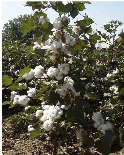
FIGURE 2 | The plant architecture of PHYA1 gene-derived and field grown (in 2013, Tashkent farm) novel RNAi cotton cultivar “Porloq-1” (translates as “Shiny-1” or “Great future-1”, Cotton Outlook, 2014).

There are several positive ramifications associated with the anticipated usage of PHYA1 -derived RNAi cultivars by farmers locally and globally that include: (1) opportunity to produce superior, novel RNAi cotton fiber that should have a premium price increase and income per acre, and (2) opportunity to spin a fine-count cotton yarn from any production zone. Furthermore, (3) early flowering and maturity of PHYA1 -derived RNAi varieties should provide an opportunity for early and