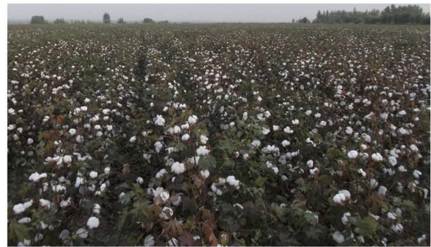
FIGURE 3 | A general view of large-field trial experimental plot in 2013 for novel Uzbek RNAi cotton cultivar “Porloq-2” derived from the sexual cross between RNAi Coker 312 (T-31 family) and Uzbek commercial Upland cultivar “C-6524” (“Mashhura-N” cotton, Namangan region, Uzbekistan). This field view demonstrates high-yield potential, early autumn induced rapid-senescence, and simultaneous boll maturity accompanied by increased anthocyanin pigmentation on stems and leaves of RNAi cotton plants under normal solar light condition.

This cultivar has been developed through genetic hybridization and multi-generation individual selection from self-pollinated F_{2-5} progeny of the sexual cross between somatically single-cell regenerated RNAi Coker-312 (T-1-7 RNAi family) and Uzbek cotton cultivar AN-Boyovut-2. RNAi of PHYA1 genes resulted in vigorous shoot and root development, bushy plant architecture, early flowering and increased boll number, early synchronous boll opening and early plant senescence with superior fiber quality parameters among other important morphological and agronomic improvements (refer to Abdurakhmonov et al., 2014 for fiber quality and yield increase details).