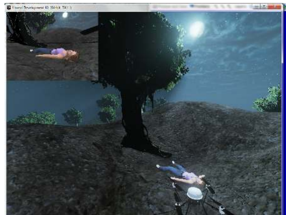
Figure 4: Outdoor scenario for the Virtual Robot competition in the Dutch Open Final 2012.

The shared map generated during the competition has a central role in the coordination of such large robot teams. This is where the sensor information selected to be broadcasted via often unreliable communication links is collected and registered. The registration process is asynchronous; some information may arrive at the base-station even minutes after the actual observation. There is no guarantee that the operator has time to look at this information directly, which implies that the map within the user interface has to be interactive and should allow the operator to call back observations that were made at any point of interest (independent of when the observation was made and by which robot). At the same time the registration process should keep the map clean (no false positives or wrong associations), because it is the area where the coordination of the team behaviors is done.