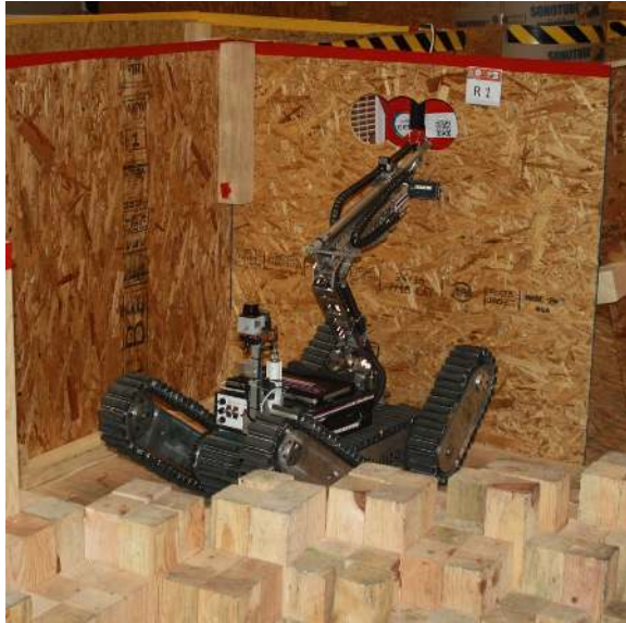
Figure 1: Rescue robot of team Stablize from Thailand inspects a simulated victim near a step field at the RoboCup 2012.

generated by the robot online. The signs of life can be the visual appearance and movements of the victims, simulated body heat, CO 2 levels, and audio signals. The harsh terrain is built of different ramps, stairs, and so called “step fields”, which is a normed pattern of wooden blocks resembling the structure of a rubble pile (see Figure 1).