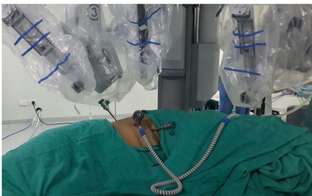
Fig. 2 Docking of robot

The patient was repositioned to supine for abdominal gastric tube mobilization, dissection of esophageal hiatus along with D2 nodal clearance through upper midline mini-laparotomy incision. The left neck was explored using transverse supraclavicular incision. Sternocleidomastoid clavicular head and strap muscles were divided and thyroid gland exposed after ligating and dividing the middle thyroid vein. Cervical oesophagus was dissected and mobilized and divided and delivered to the abdomen. A gastric tube was fashioned based on the right gastric and right gastroepiploic vessels and then pulled up into the left neck through esophageal hiatus. Side to side stapled or end to end hand sewn esophagogastric anastomosis was then performed in the left neck and neck wound was closed over No 12 Romovac® suction drain. Feeding jejunostomy was performed and the abdomen was closed with a right subhepatic drain in place. The left intercostal tube drain was placed prophylactically in all cases.