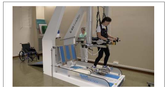
FIGURE 1 | The G-EO system used in the Robot-Assisted Stair-Climbing Training (Written informed consent was obtained from the individual pictured, for the publication of this image).

Patients underwent Robot-Assisted Stair-Climbing Training (RASCT) with the G-EO system device (Reha Technology, Olten, Switzerland) (Figure 1). This end-effector robotic device can reproduce the gait pattern and realistically simulates the ability to carry out stairs up and down. The patients stood with feet secured to two foot-plates whose kinetics and kinematics parameters of the movement were adjustable. The foot-plates have three degrees of freedom each, allowing to control the step length and height and the foot-plates angles. The maximum step length corresponds to 550 mm, and the maximum achievable step height is 400 mm. The maximum angle of rotation is \pm 90^\circ . This angle controlled the plantar- and dorsiflexion of the ankles during the steps. The maximum foot-plates speed is 2.3 km/h. A physiotherapist set the pace and step length according to the patient's impairment and the improvements achieved. Patients were secured by a harness fixed to an electric patient lift system. This system helped patients to be sustained during the walking or stair climbing task. Moreover, the G-EO system provides real-time feedback on the patient's movements (Hesse et al., 2012).