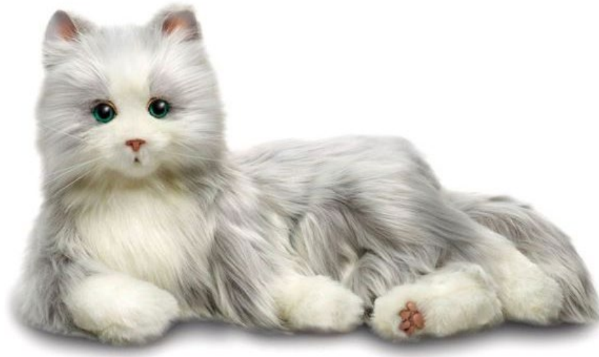
Figure 1: The ‘Ageless Innovation’ companion cat

This product is marketed specifically for older people, and “... with a focus on improving quality of life for aging loved ones, their families, and caregivers” (“Ageless Innovation”, 2019). The cat vocalizes with meows and purrs in reaction to light and touch, via its on-board sensors. It moves its mouth, eyes, head and also rolls over, again in response to human interaction. Strictly speaking, it is not a robotic device, as in its off-the-shelf form, it is not programmable. However, it operates in two modes: mute or sound. In both modes, the cat’s movements continue to function. It is battery-powered, and the researchers have tested that the replaceable battery life is long (months, not weeks).