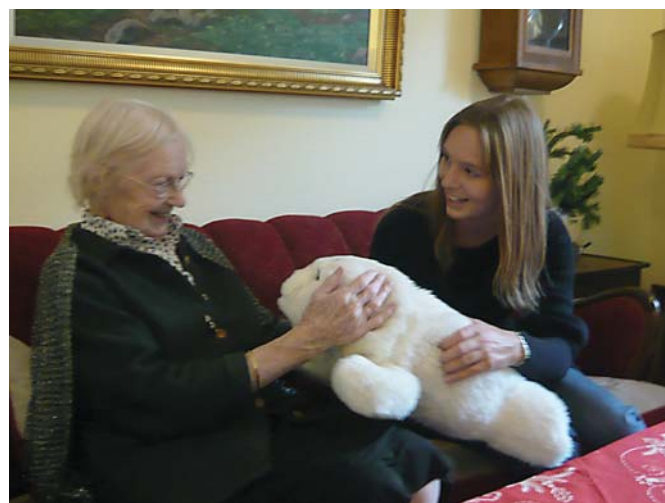
Color version available online

Various robots have been developed and are being introduced in our lives as commercial products. Each robot is designed for a specific purpose. The seal-type mental commitment robot, Paro, whose goal is to enrich daily life and heal human minds, is designed to maintain long-