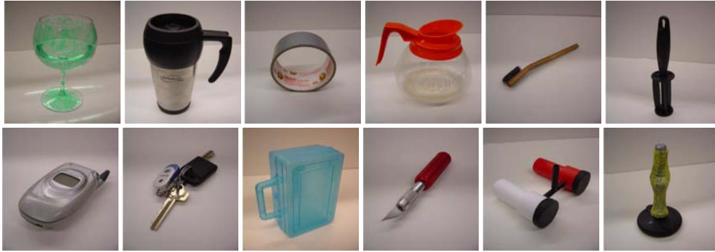
Figure 1: Examples of objects on which the grasping algorithm was tested.

In prior work, a few others have also applied learning to robotic grasping. [1] For example, Jebara et al. [8] used a supervised learning algorithm to learn grasps, for settings where a full 3-d model of the object is known. Hsiao and Lozano-Perez [4] also apply learning to grasping, but again assuming a fully known 3-d model of the object. Piater’s algorithm [9] learned to position single fingers given a top-down view of an object, but considered only very simple objects (specifically, square, triangle and round “blocks”). Platt et al. [10] learned to sequence together manipulation gaits, but again assumed a specific, known, object. There is also extensive literature on recognition of known object classes (such as cups, mugs, etc.) [14], but this seems unlikely to apply directly to grasping objects from novel object classes.