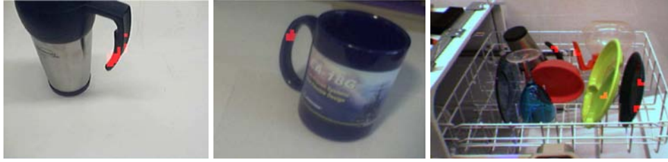
Figure 5: Grasping point classification. The red points in each image show the most likely locations, predicted to be candidate grasping points by our logistic regression model. (Best viewed in color.)