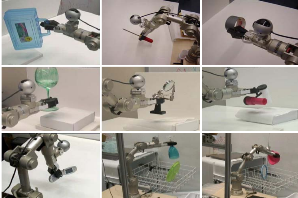
Figure 6: The robotic arm picking up various objects: box, screwdriver, duct-tape, wine glass, a solder tool holder, powerhorn, cellphone, and martini glass and cereal bowl from dishwasher.