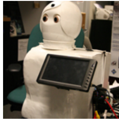
Fig. 1: One of the set of robots built for the long-term HRI study.

There are several key features that are desirable for robots to be used in a long-term study of HRI. The ability to look at the user (or appear to do so) is important for drawing a person into the interaction. A robot in which the software that controls the human interaction is easily modifiable is vital, as many aspects of the interaction will need to be adjusted as user tests are conducted. Some set of features that enable social interaction (e.g. eye contact; look-at behaviors; head, arm, and hand gestures; speech; and speech recognition) are needed, but the exact set depends on the type of interactions expected.