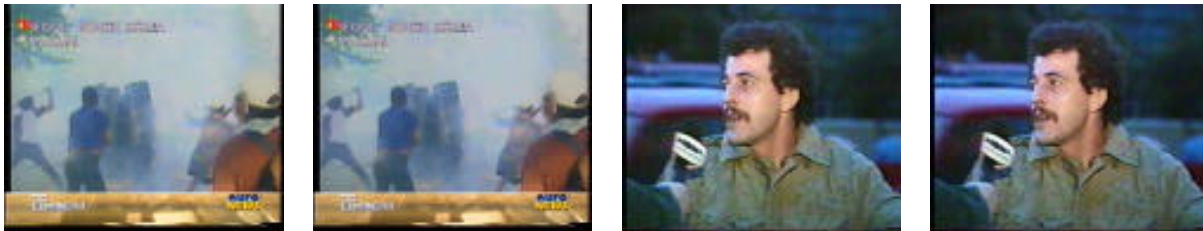
Figure 2. An original and a 3D DFT watermarked frame. Left: “no comment” sequence. Right: “news”sequence .

blocks of 32 frames were used (see Figure 2). Note that the embedded mark verify the invisibility requirement as shown in Figure 2.