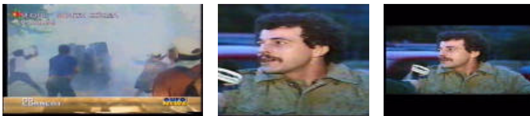
Figure 3. Movies rescaled from 4/3 to 2.11/1 . Left: rescaled “no comment”. Center: rescaled “news”, cropped to its original size. Right: rescaled “news”, padded to its original size.

For both sequences and both algorithms the embedded message, “Hello Earth”, was of 88 bits long. The main tests concerned the resistance to MPEG compression, aspect-ratio changes with or without additional recropping/padding of frames to their original size (see Figure 3). To test the resistance to MPEG-2 the recompression was done at the “main” profile, “main” level and in standard quality mode.