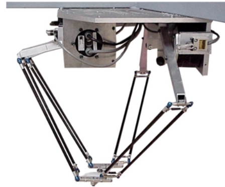
Fig. 1. H4 robot.

In this paper, the problem of dynamic robot parameter estimation is expressed with a model which is linear with respect to the physical parameters. The estimation problem is then stated as a linear interval constraint satisfaction problem (CSP). Interval fixed-point contractors make it then possible to compute a smallest box outer-bounding the solution set (Jaulin et al. , 2001).