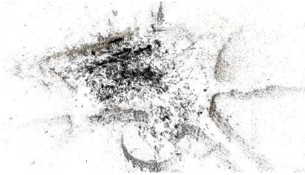
Fig. 4. A large reconstruction of Trafalgar Square containing 4597 images