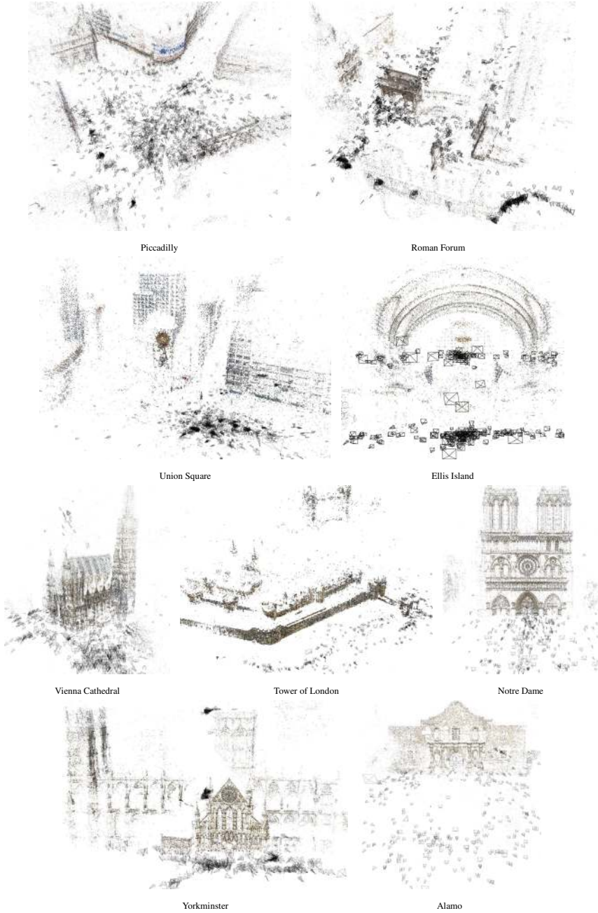
Fig. 3. Selected renders of models produced by our method