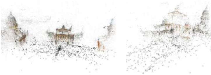
Fig. 5. (a) A correct model of Gendarmenmarkt from [19]. (b) A broken model by our method.

consistent outliers, such as those arising from ambiguous structures in the scene. To deal with these cases, SfM disambiguation methods could be used [23,15,22].