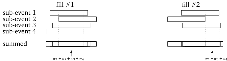
Figure 2: A pictorial view of how the sub-windows are constructed for a one dimensional histogram.