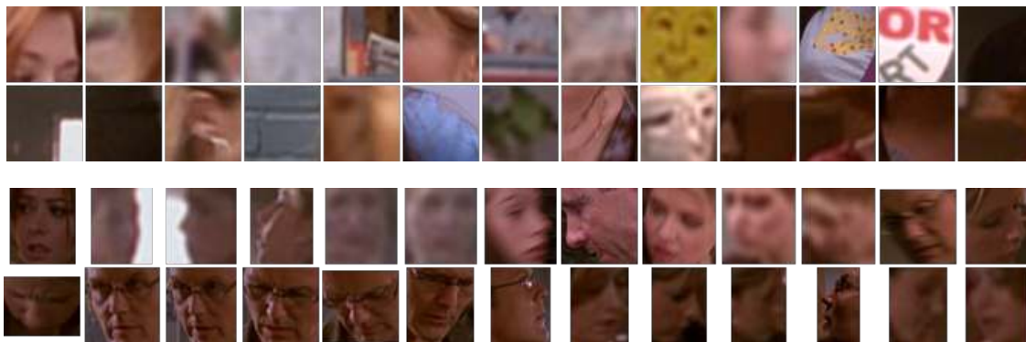
Figure 2. Excerpt of false positives (two top rows) and misses (two bottom rows) of our approach on the Buffy dataset.

multiple frames tend to be hard to prune in the tracking stage. Misses are either dark, blurry, highly non-frontal or tilted faces. The latter can be overcome by using additional face detectors trained for tilted angles.