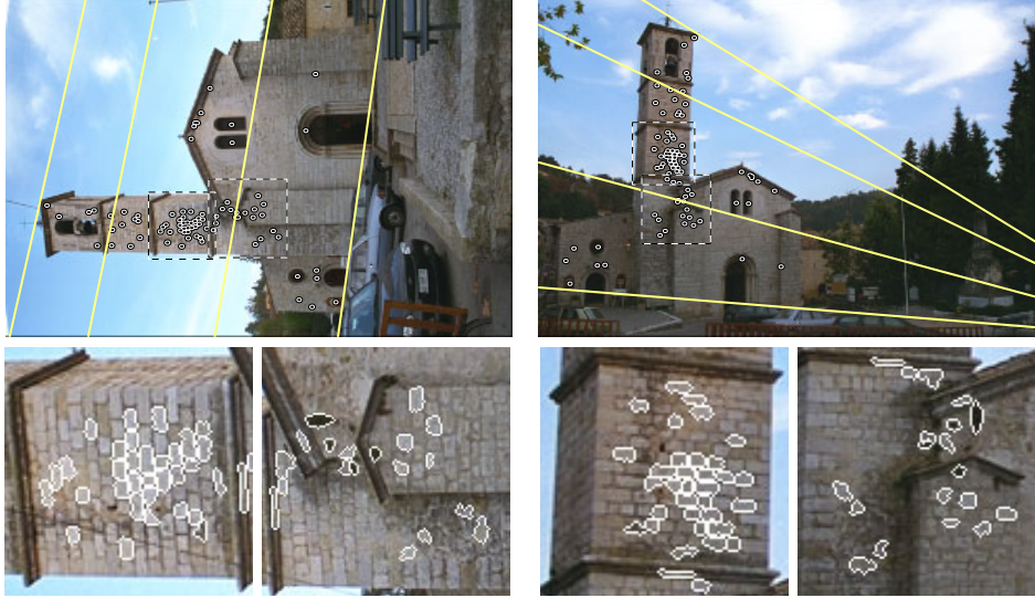
Figure 2: VALBONNE: Estimated epipolar geometry and points associated to the matched regions are shown in the first row. Cutouts in the second row show matched bricks.

image since the rest of the scene is not visible in the second view. Different resolution of detected features is evident in the close-up. Valbonne , (Fig. 2). This outdoor scene has been analysed in the literature [10, 9]. Repetitive patterns such as bricks are present. The part of the scene visible in both views covers a small fraction of the image.