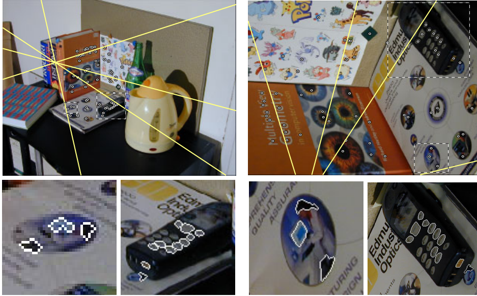
Figure 1: BOOKSHELF: Estimated epipolar geometry on indoor scene with significant scale change. In the cutouts the change in the resolution of detected DRs is clearly visible.

Tentative correspondences using correlation. Invariant description is used as a preliminary test. The final selection of tentative correspondences is based on correlation. First transformations that diagonalise the covariance matrix of the DRs are applied. The resulting circular regions are correlated (for all relative rotations). This procedure is done efficiently in polar coordinates for different sizes of circles.