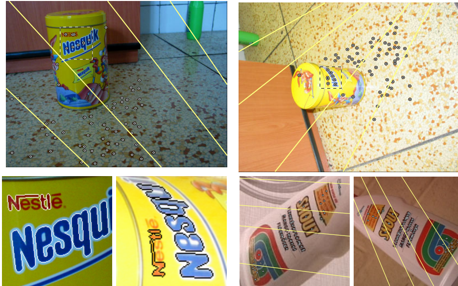
Figure 5: CYLINDRICAL BOX: Epipolar geometry (top) and matched regions (bottom left). Fully affine distortion, a non-planar object, textured surface and a strong specular reflection are present in the scene. SHOUT (bottom right), a scene with a change of illumination spectral power distribution.