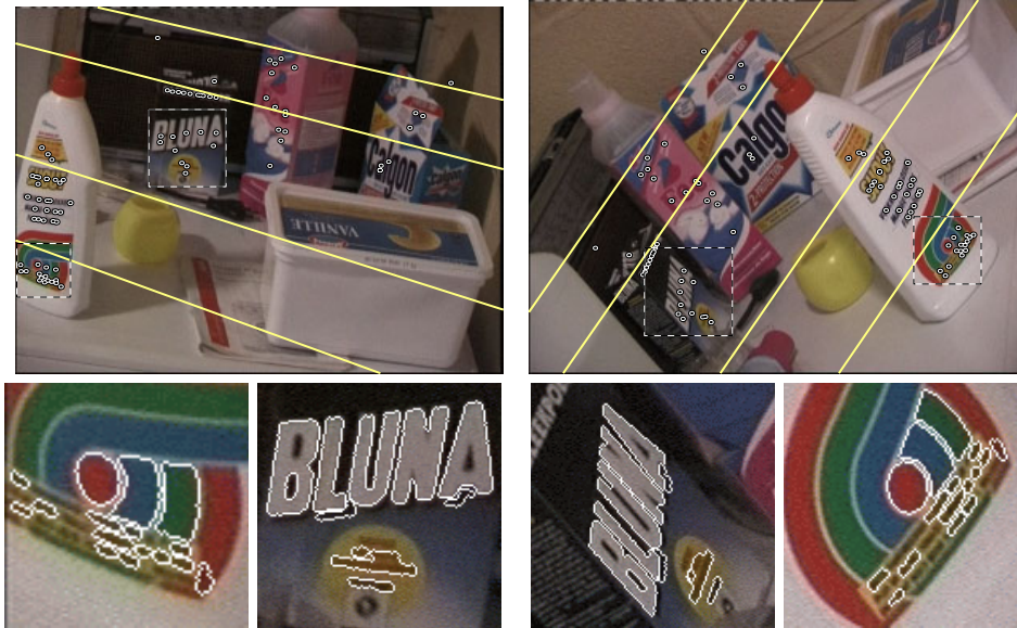
Figure 3: WASH: Epipolar geometry and dense matched regions with fully affine distortion.