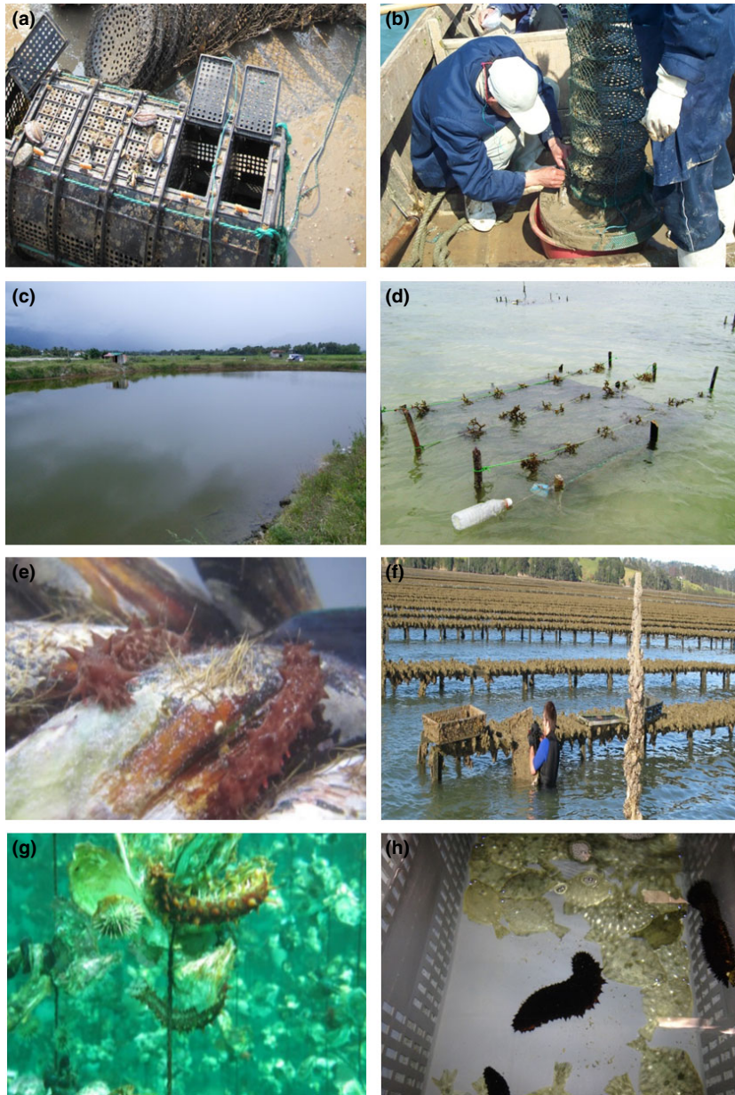
Figure 2 Different forms of experimental and commercial integration of deposit-feeding sea cucumbers into existing culture systems. (a) Suspended cage systems used for the IMTA of abalone ( Haliotis discus hannai ) with Apostichopus japonicus in coastal areas in northern China (Photo credit: Xiutang Yuan). (b) Lantern nets used for the IMTA of bivalves, together with Apostichopus japonicus in coastal areas of northern China (Photo credit: Xiutang Yuan). (c) Former shrimp intertidal pond conditioned for the growing of Holothuria scabra in Vietnam (Photo credit: Leonardo Zamora). (d) Experimental cage designed for the IMTA of the red seaweed Kappaphycus striatum and the tropical sandfish, Holothuria scabra , in a lagoon located in the United Republic of Tanzania (Photo courtesy of Marisol Beltran-Gutierrez). (e) Hatchery-reared juvenile Australostichopus mollis held together with the Greenshell™ mussel Perna canaliculus in experimental tanks (Photo credit: Leonardo Zamora). (f) Checking the experimental bottom cages for holding Australostichopus mollis under a Pacific oyster, Crassostrea gigas , rack and rail farming system in an intertidal mudflat in north-eastern New Zealand (Photo credit: Leonardo Zamora). (g) Naturally settled juveniles of Parastichopus californicus in an oyster line, which then fall down to the sediment and become part of the fishing stock or are collected and reseeded in a licensed IMTA shellfish/finfish farm in British Columbia, Canada (Photo courtesy of Dan Curtis, DFO). (h) Experimental recirculation aquaculture system for the IMTA of the starry flounder, Platichthys stellatus , with Holothuria forskali in northern Germany (Photo credit: Matthew Slater).