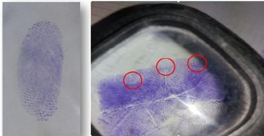
Fig I: Analysis of finger and palmar patterns

All the participants were asked to wash their hands with soap in order to remove all the dirt. Then the fingertip and palmar patterns of each participant were recorded by using standard ink method, using blue duplicating ink (Kores India Limited, Mumbai), thick white printing paper (JK Copier, A4 size, 100 g/m 2 ) and sponge pad. 9 The finger and palmar prints obtained using this method were studied with the help of magnifying glass. For each individual all ten finger patterns were recorded. The parameters were assessed by both the qualitative and quantitative analysis. The parameters assessed qualitatively were finger print patterns including arches, loops (ulnar loop, radial loop) & whorls and palmar patterns in which assessment of accessory tri-radii was evaluated as shown in Fig I. Palmar tri radii patterns are of two types: digital (a, b, c, d) and axial/carpal (t). Accessory tri radii which are considered as genetic variants are denoted as a', b', c', d' and t'. 10