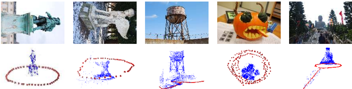
Figure 3: Images and reconstructions of the datasets in Table 2.