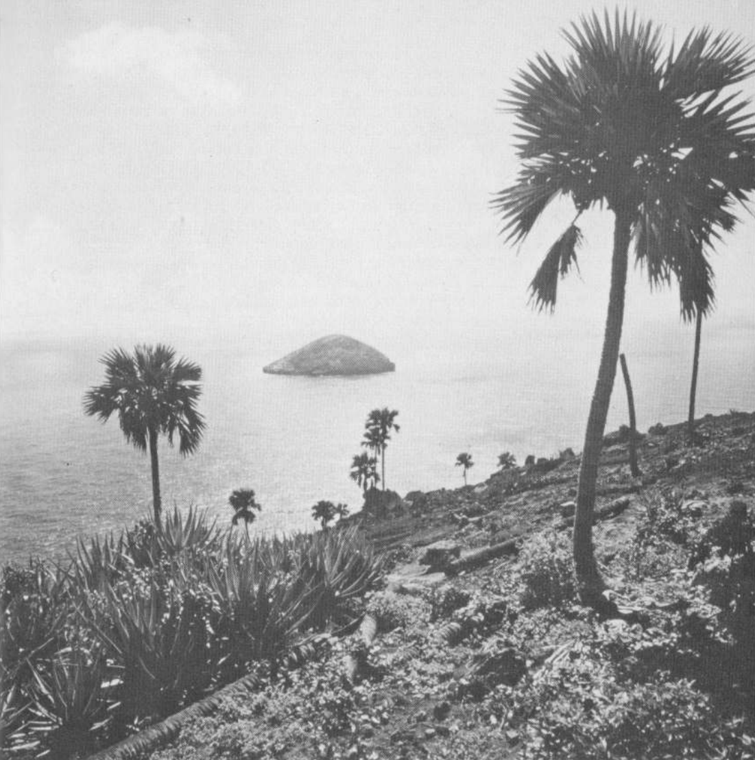
Latania palms Latania loddigessii on Round Island, framing a view of Serpent Island Heather Angel

ever, it seems to be the most sheltered area, and so may maintain a reservoir population able to recolonise other parts of the island after a dramatic crash in numbers such as the 1975 one. This gecko lays pairs of eggs in October to December, 4 usually under rock overhangs protected from wind and predators. Occasionally one or two pairs of eggs were found on living Latania fronds, and once on the trunk of a Pandanus tree. Most sites are on the north-west and west flanks above the palm savanna, although a few isolated ones were found on the south-west and south slopes. In the exposed