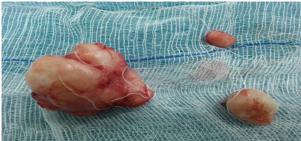
FIGURE 2: Pathological specimens.