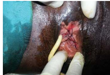
FIGURE 4: Postoperative appearance of the vulvar region.

an incision of 1 cm was made on the left anterolateral wall of the vagina. After that, the 5-cm solid mass was excised totally with some hymenal tissue surrounding the tumoral structure and after operation normal anatomic imagine was seen (Figures 2 and 4). The patient was discharged on the second day with an uneventful postoperative period. Histopathocological evaluation revealed left vulvar mass as a leiomyoma of round ligament. Round ligament of uterus