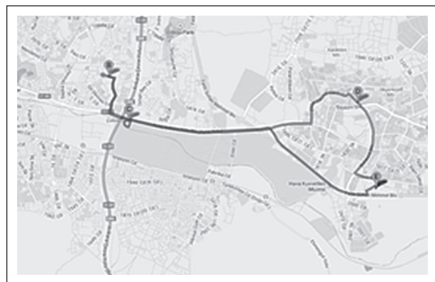
Figure 1 – Solution for Ankara