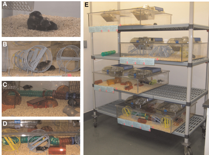
Figure 1. Housing of the experimental animals. Female C57Bl/6 mice ( n = 10 per group) were housed in large cages ( 30'' \times 33'' \times 8'' ) as shown. (A) Control (CON). (B) Running (RUN); cage with 10 running wheels for voluntary physical activity. (C) Enriched environment only (EEO). (D) Enrichment and running (EER); the cage contained enrichment objects similar to C, as well as 10 running wheels. (E) Overview of the experimental cages.

and analyzed. Mice were perfused with 0.9% saline, and brain tissue was quickly removed, the hippocampus dissected and frozen on dry ice. Tissue was stored at -80^{\circ}\text{C} for later protein extraction to quantify mature BDNF peptide levels in the hippocampus.