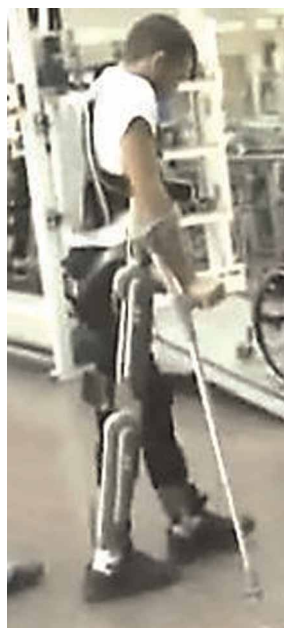
Figure 2 Walking with the ReWalk™

Exclusion criteria included: history of severe neurological disorder other than SCI (multiple sclerosis, cerebral palsy, amyotrophic lateral sclerosis, traumatic brain injury, stroke, etc.); concurrent severe medical disease; pressure sores; unstable spine, unhealed limb or pelvic fractures; and psychiatric or cognitive status that may interfere with the trial.