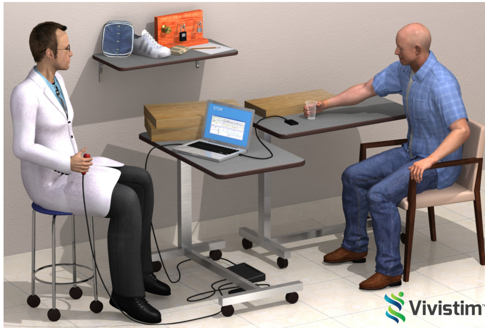
Figure 1. Schematic of vagus nerve stimulation device use in a typical therapy session.

with the Stroke Application Programming Software was used to program the IPG and initiate VNS. The stimulation was manually triggered by the therapist using a push button, while the patient performed a task (Figure 1). Stroke Application Programming Software allows the therapist to control the relative timing of stimulation to therapy exercises using the push button. The software also allows the physician to program the stimulation parameters (amplitude [mA], frequency [Hz], pulse width [ \mu S], and duration [ms]), captures patient programming history, and checks lead impedance and battery status. A 500-ms burst of VNS was delivered to the VNS group during each movement (the rehabilitation-only group did not have a device implanted). Each stimulation consisted of fifteen 0.8-mA, constant current, charge balanced pulses (100- \mu s pulse width, 30-Hz frequency). These stimulation parameters grew out of hypothesis-driven research in humans and animal models, 10–14 including studies of cortical map plasticity and electroencephalogram desynchronization using VNS. 12 Note stimulation was only delivered to the left vagus nerve to avoid activation of the sinoatrial node (which is innervated by the right vagus nerve), but bilateral neuronal connections mean stimulation should affect both cerebral hemispheres. Full details are given in the Methods in the online-only Data Supplement.