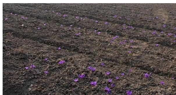
Figure2. Saffron flowering in Fields of Pampore, Pulwama