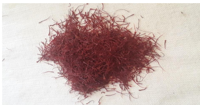
Figure4. Kashmiri Saffron Ready for Use

After the plucking of flowers in very first year of cultivation, the saffron fields are being left untouched upto the advent of new spring (March/April). The fields are again being prepared for yielding of crop. This time only hoeing is done, i.e., operation of providing aeration to the soil, which is considered very useful for the development of corms. Followed by second hoeing in the mid of August, considered to be very much important for good yield of saffron. The last hoeing is done in September, about 30 to 35 days before the flowering of crop and the repairing of saffron beds and drainage channels is also finalized. These operations of hoeing are very much useful for the growth and health of corms and for the good yield of saffron as it provides the aeration to the soil and corms and through which the delicate stems of flowers emerge on the surface.