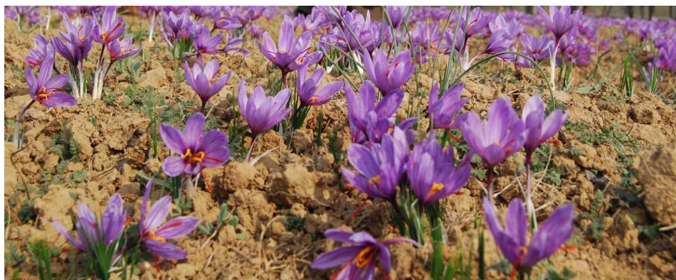
Figure3. Harvesting/Flower plucking time of Saffron in Pampore, Pulwama

Late sowing as well as early sowing of seeds is not recommended in the saffron cultivation. The seeds are generally being sown at the depth of about 8cm to 11cm (4 to 6 inches), however, there is not any strict rule for the planting of seed corms. A distance of about 7cm to 16cm is in between of corms is said to be good for the better yield of crop as when the plant grows it produces a number of baby plants as its outgrowth, so farmer has to leave ample space for these outgrowths of the parent plant. The sowing is done by two methods, either by ploughing method or by zoon method. Plough method is practiced by the large number of farmers as it is easy and less expensive method because labour force needed in sowing gets expensive. The corms are sown in rows, and the field is laid out in square beds by providing the drainage channels outside the beds to drain out the excess amount of water after natural showers (rains) or artificial sprinkler irrigation, so that corms may not get damaged. The bed of Saffron seeds is called as “Poshaware” in Kashmiri. Then after the successful sowing of corms, the field needs time to time water showers, till the time of flowering, as the flowering will do start in the very first year, if properly managed and practiced.