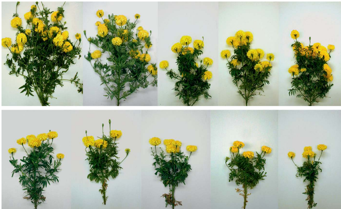
Fig. 5. Marigold Tagetes erecta 'Yellow Climax' plants at experiment termination. From left to right, plants irrigated with water with electrical conductivities of 2, 4, 6, 8, and 10 \text{dS}\cdot\text{m}^{-1} , respectively. Top plants were irrigated with water of pH 6.4 and bottom plants with water of pH 7.8.

flower production and quality are not severely affected. In addition, 'Yellow Climax' produced attractive cut flowers with acceptable vase life of the flowering stems from plants grown in the 6 \text{dS}\cdot\text{m}^{-1} treatment.