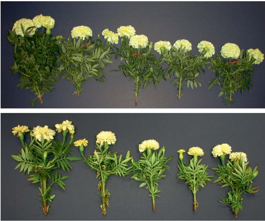
Fig. 3. Marigold Tagetes patula 'French Vanilla' plants at experiment termination. From left to right, plants irrigated with water with electrical conductivities of 2, 4, 6, 8, and 10 \text{dS}\cdot\text{m}^{-1} , respectively. Top plants were irrigated with water of pH 6.4 and bottom plants with water of pH 7.8.

quality of cut flowers of both cultivars was also reduced by Day 7 when \text{EC}_w was 6 and 10 \text{dS}\cdot\text{m}^{-1} ; however, in 'Yellow Climax', quality of harvested flowers of plants irrigated with \text{EC}_w 6 \text{dS}\cdot\text{m}^{-1} was similar to that of control plants, suggesting a higher tolerance.