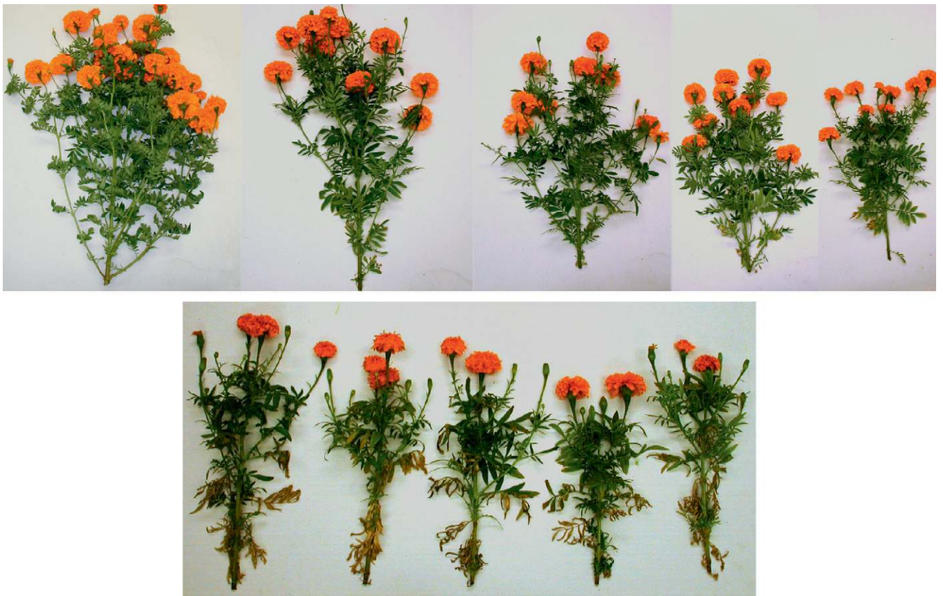
Fig. 4. Marigold Tagetes erecta 'Flagstaff' plants at experiment termination. From left to right, plants irrigated with water with electrical conductivities of 2, 4, 6, 8, and 10 \text{dS}\cdot\text{m}^{-1} , respectively. Top plants were irrigated with water of pH 6.4 and bottom plants with water of pH 7.8.

'Yellow Climax' exhibited similar trends as 'Flagstaff' but appears to be more salt-tolerant. Shoot DW decreased by 24% and plant height decreased by 21% when \text{EC}_w was 8 \text{dS}\cdot\text{m}^{-1} . In addition, the total number of flowering shoots produced and flower diameter were not decreased significantly when \text{EC}_w was lower than 8 \text{dS}\cdot\text{m}^{-1} , suggesting that