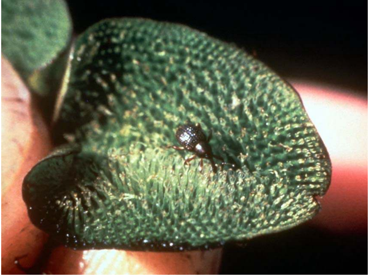
Figure 3. Photograph of Cyrtobagous salviniae on S. minima (from USACE 2001 and USDA, Agricultural Research Service (ARS))