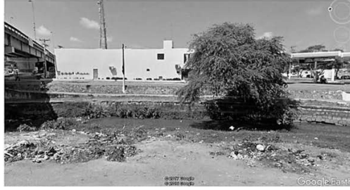
Figure 4. Riacho Salgadinho, Maceió, Alagoas.