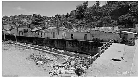
Figure 2. Vale do Reginaldo, Maceió, Alagoas.