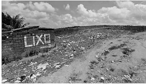
Figure 3. The birth of a dumping ground, Rio Largo, Alagoas.