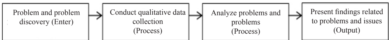
Figure 1. Simple research design on the internalization of the value of independence in pondok pesantren (Taufik, 2013)

at pondok pesantren . Most of the santri had a high interest in entrepreneurship, but the interest was low in most pondok pesantren with santri aged around ten. It was influenced by mental and emotional readiness in managing business. In addition to the students' interest in entrepreneurship, self-efficacy also influenced students to develop and recognize their potential in entrepreneurship through particular abilities and experiences continuously.