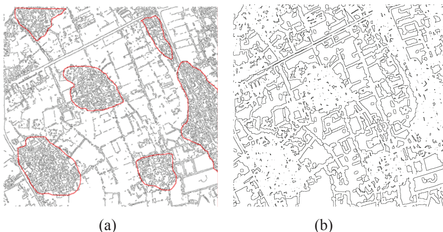
Figure 1. Edge enhancement. (a) The edges extracted from the optical image. The areas in the red outlines are trees; (b) The edge features generated by expanding edges in (a).

Edge features are extracted from optical and SAR images using Canny operator, and then they are expanded to suppress invalid edges (edges of trees) and connect discontinuous edges.