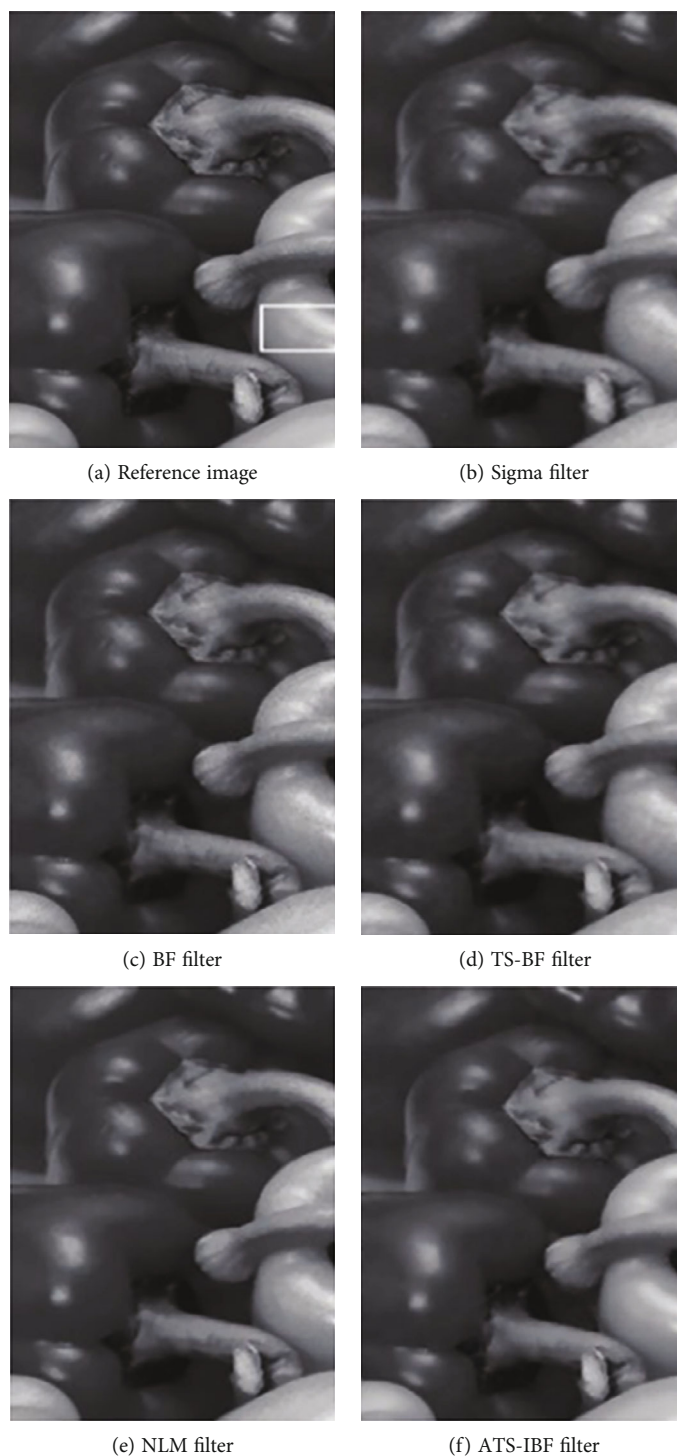
FIGURE 2: Comparison of noise suppression processing of analog images by different filtering algorithms.

describing the experimental data. Equivalent view number ENL and edge similarity index ESI are used to measure the edge preservation ability of bilateral filter processing images.