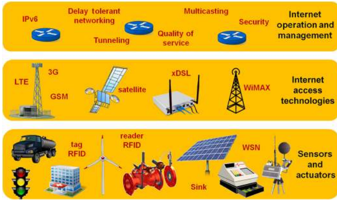
Fig. 1. System view of IoT.

the term M2M when the focus is on the more specific aspect of the IoT related to the communication of machines (i.e., a smart object) with each other or with a server on the other end of the communication link.