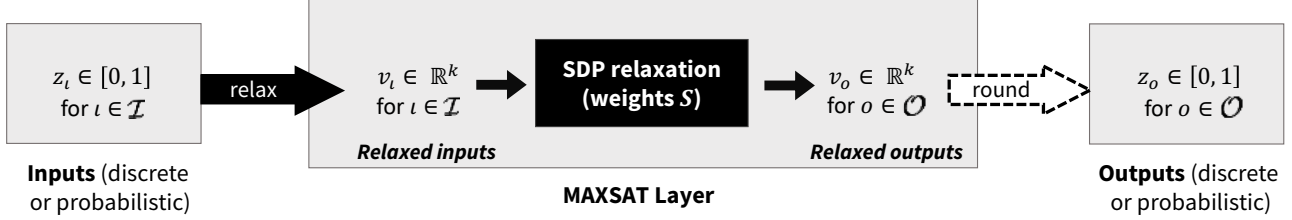
Figure 1. The forward pass of our MAXSAT layer. The layer takes as input the discrete or probabilistic assignments of known MAXSAT variables, and outputs guesses for the assignments of unknown variables via a MAXSAT SDP relaxation with weights S .

variable i \in \{1, \dots, n\} , and define \tilde{s}_i \in \{-1, 0, 1\}^m for i \in \{1, \dots, n\} , where \tilde{s}_{ij} denotes the sign of \tilde{v}_i in clause j \in \{1, \dots, m\} . We then write the MAXSAT problem as