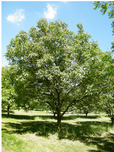
Fig. 2. Tree of 'Sava' walnut at the end of the 14th vegetation period (8.1 m tall, 8.7 m in canopy diameter).