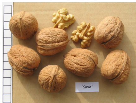
Fig. 4. Nuts of 'Sava' walnut.

late spring frosts. It bears nuts on the tops of strong annual shoots that are inserted on 2-year-old or older parent shoots (intermediate fruiting behavior). Vegetative growth and fruiting are very well balanced. Yield is regular, about the same as in 'Franquette' and higher than in 'G-139', having better yield efficiency than both control cultivars (Fig. 3).