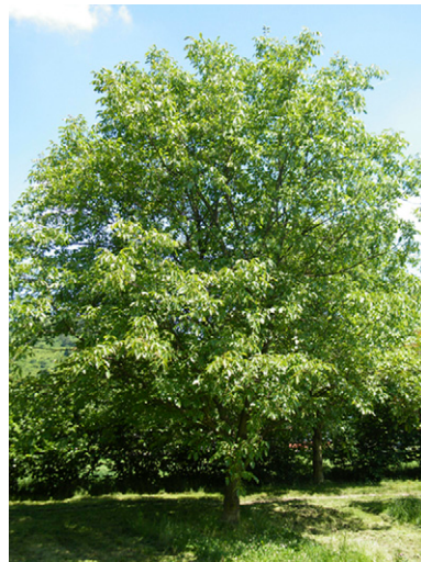
Fig. 5. Tree of 'Krka' walnut at the end of the 14th vegetation period (9.6 m tall, 8.5 m in canopy diameter).