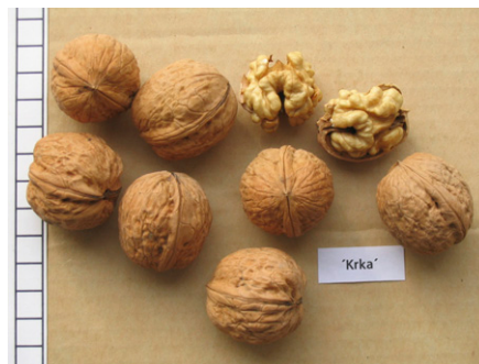
Fig. 6. Nuts of 'Krka' walnut.

(males) after planting. Flowering is highly homogamous. Pollen shedding completely coincides with pistillate bloom and assures self-pollination and yielding without other pollenizers (Fig. 1). The tree produces a lot of male inflorescences and could be used as a pollenizer for medium-flowering cultivars such as 'Chandler', 'Adams', and 'Ferjean'. 'Krka' harvest occurs in midseason, ≈1 week earlier than in 'Franquette'. Leaves fall in the last days of October, 2 to 3 d earlier compared with both control cultivars.