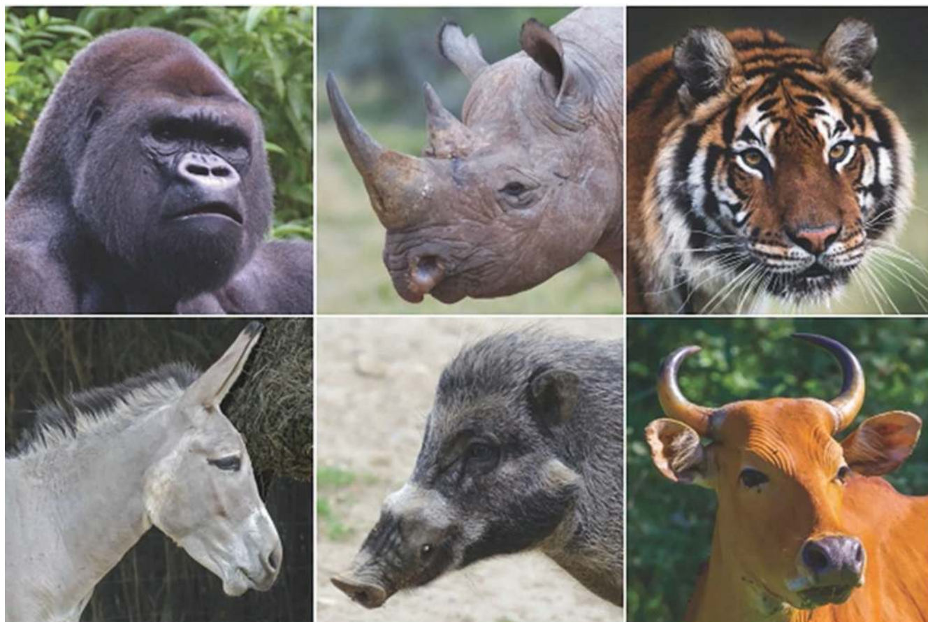
Figure 2. Photographic examples of threatened megafauna. Top row left to right: photos of well-known species, including the Western gorilla ( Gorilla gorilla ) (CR), black rhino ( Diceros bicornis ) (CR), and Bengal tiger, ( Panthera tigris tigris ) (EN). Bottom row left to right: photos of lesser-known species, including the African wild ass ( Equus africanus ) (CR), Visayan warty pig ( Sus cebifrons ) (CR), and banteng ( Bos javanicus ) (EN).

imperiled (tables S1 and S2). Most of the world's megaherbivores remain poorly studied, and this knowledge gap makes conserving them even more difficult (Ripple et al. 2015).