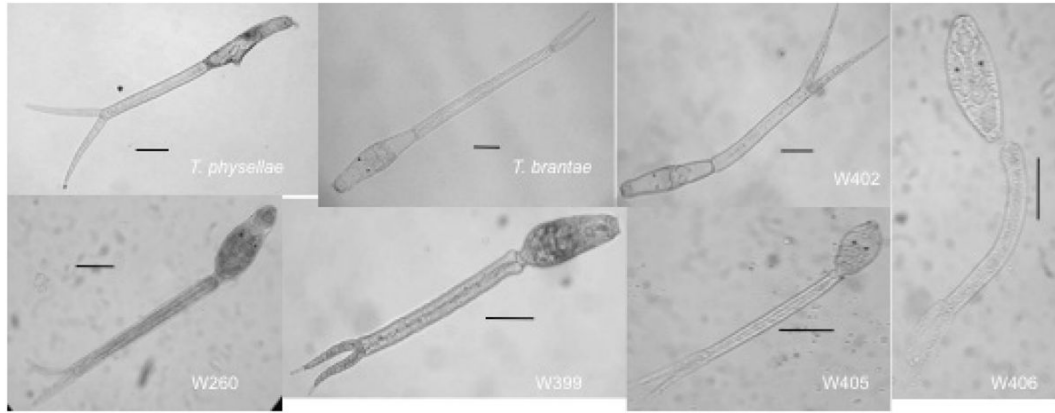
Figure 2. Images of live cercariae collected during the survey. The sample number on each image corresponds to the samples listed in table 2. Measurements for these cercariae can be found in table 3. Bar = 100 \mu m.