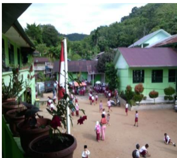
Figure 14. Flower and Infrastructure Management in MIN 2 Sibolga

Managing school infrastructure is done by (1) organizing a classroom where the lower grade is on the first floor, and the higher grade is on the second floor.