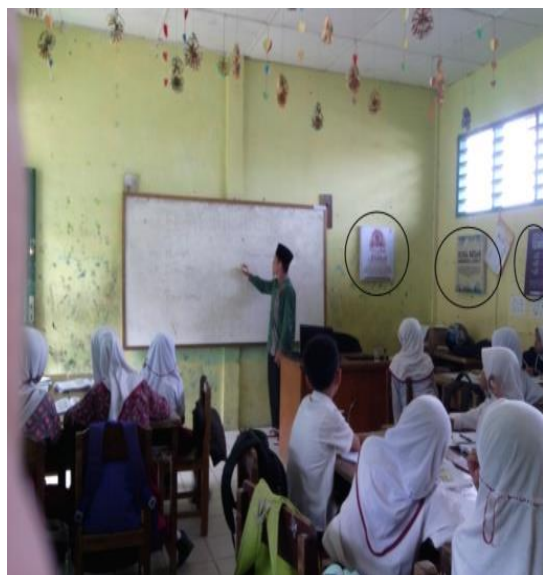
Figure 8. Poster containing hadith, religious advices, and prayers displayed on the wall.

Based on the picture, commonly the students will be attracted to see the posters. It is because the posters are displayed on an ideal spot for young learner vision. Further, the posters displayed by the school personnel are as follows.