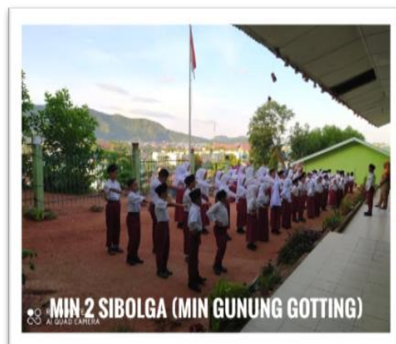
Figure4. The 2 nd Building MIN 2 Sibolga

In the current development, MIN 2 Sibolga has two buildings located in two different districts. The first building is known as “MIN Kaje-Kaje” or its old official name as “MIN Aek Habil”, located on Jl. SM. Raja Gg. Gotting Kelurahan Aek Parombunan.