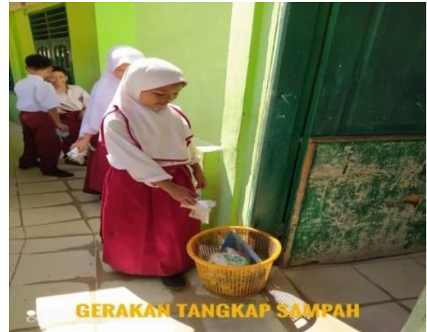
Figure 5. Collecting Rubbish Activity (CRA)

Collecting rubbish activity is a cleanlife culture and loving environment practiced daily by the students in MIN 2 Sibolga.