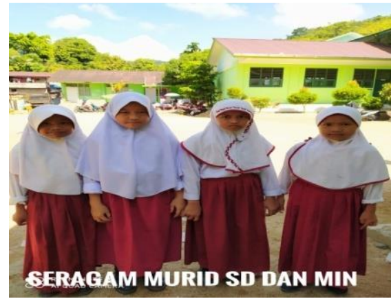
Figure7. MIN 2 Sibolga and SDN 087659 Student Uniforms

Uniform is an important thing to show school identity. The MIN 2 Sibolga uniform is following the color and model regulated by the government. Further, there is a unique in MIN 2 Sibolga students' uniform in which according to Sibolga Education Authorities instruction, the male wears trousers, and the female wears a long skirt and craft.