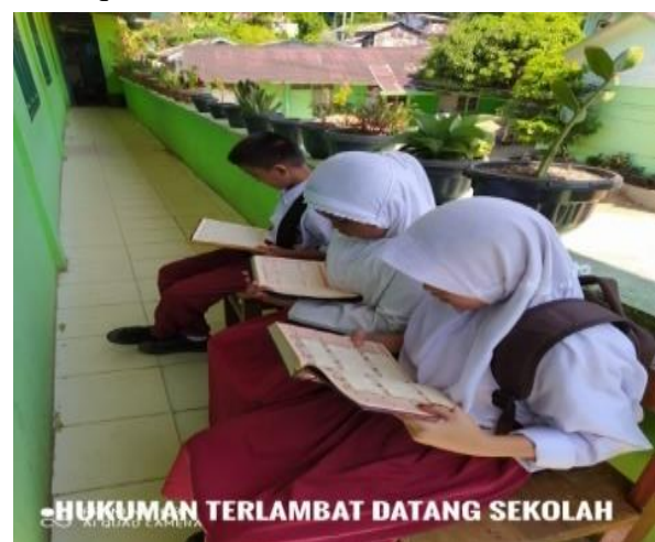
Figure6. Punishment to the Students who Come Late

Late and punishment is an affirmation inflicted by the school personnel on the students. It is begun by socializing it to the students as a disciplined exercise. So, before coming late, the students knew the consequences.