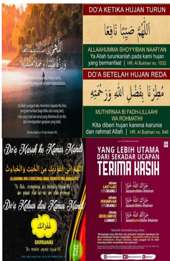
Figure 9. Some Examples of Posters Displayed in the Classroom.

Based on the picture, commonly the students will be attracted to see the posters. It is because the posters are displayed on an ideal spot for young learner vision. Further, the posters displayed by the school personnel are as follows.