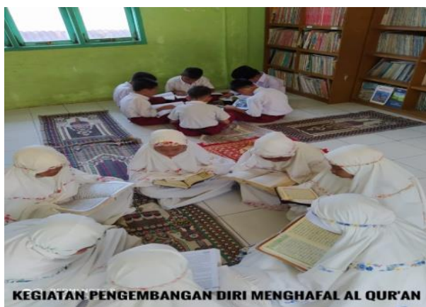
Figure 13. Self-development Activity

Self-development is a given discretion to the students to improve their potential. It is supported by spirit and activity facilities given by MIN 2 Sibolga. The self-development refers to learn PAI (Islamic teachings) material deeply, including reading, writing, memorizing Qur'anic verse and hadith, and practicing ablution procedures, salat (prayer), zikir , and praying.