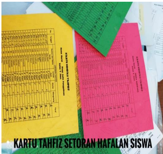
Figure10. Student's Recitation Card