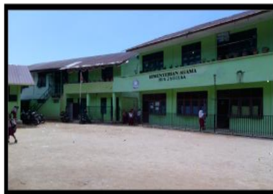
Figure2. Field of MIN 2 Sibolga