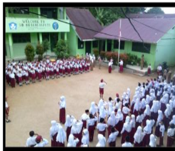
Figure3. Field of SDN No. 087659

Its location which is directly placed in front of SDN 087659 gives chance as well as a challenge for the school personnel. One of the challenges is that MIN 2 Sibolga does not have its own field since it was built 31 years ago, so it has to use SDN 087659 field. Also, the close position of the schools makes MIN 2 Sibolga must be competitive in the interacting public interest and adjusts public needs through recommended activities and school routine. Here is the documentation of MIN 2 Sibolga and SDN 087659 position.