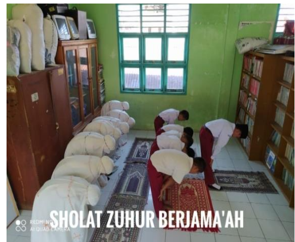
Figure 11. Pray Together in MIN2Sibolga

These habituations are to guide the students to say good things, and indirectly to pray for one another so as to get the blessing and "conducive" climate in the school. Further, pray together activity is done two times, Dhuha prayer and Zuhur prayer.